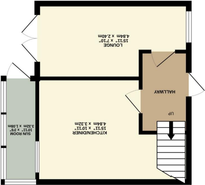
GROUND FLOOR 336 sq.ft. (31.2 sq.m.) approx.